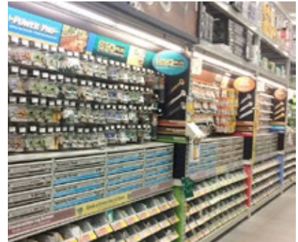
HOME DEPOT - Retail Merchandising