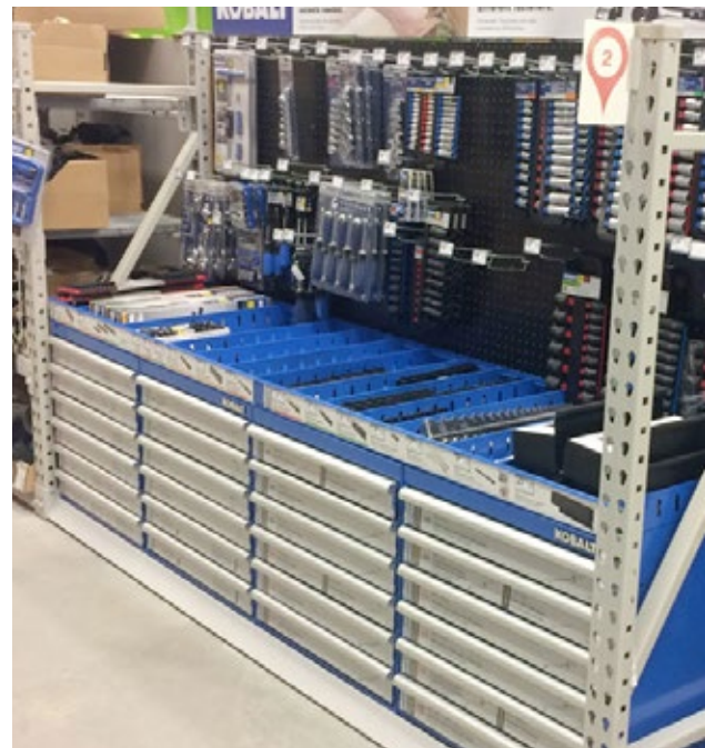
KOBALT Retail Merchandising