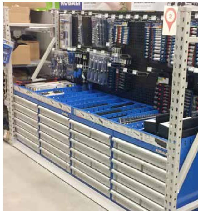
KOBALT Retail Merchandising