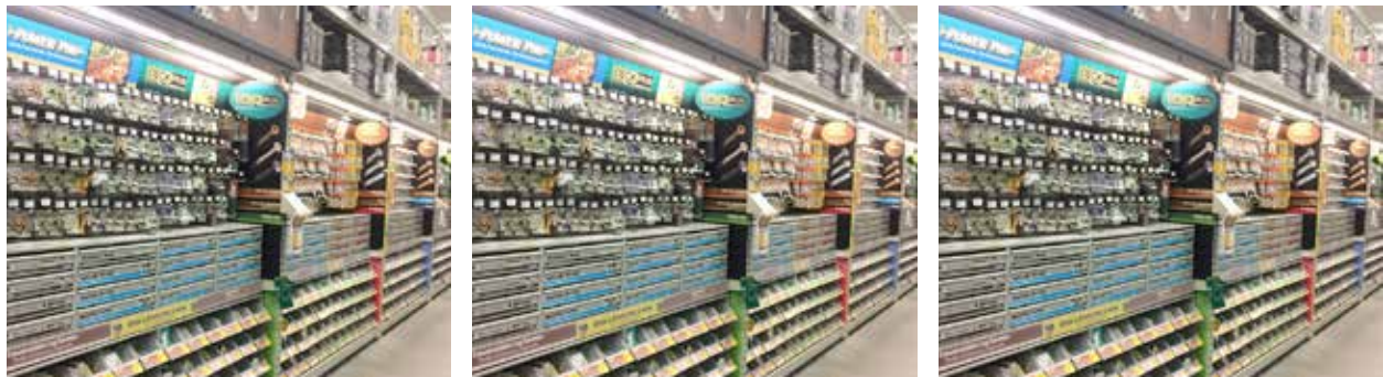
HOME DEPOT - Retail Merchandising

Orders will be shipped by requested carrier whenever possible. If carrier is not specified, Platt & LaBonia Co. LLC will ship via best available routing and carrier.