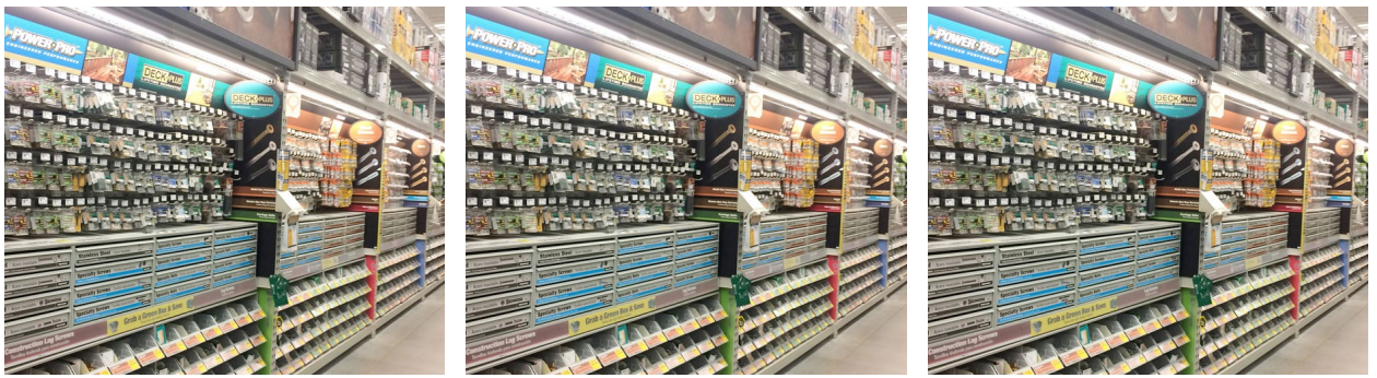
HOME DEPOT - Retail Merchandising

Orders will be shipped by requested carrier whenever possible. If carrier is not specified, Platt & LaBonia will ship via best available routing and carrier.