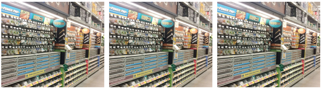
HOME DEPOT - Retail Merchandising

Orders will be shipped by requested carrier whenever possible. If carrier is not specified, Platt & LaBonia will ship via best available routing and carrier.