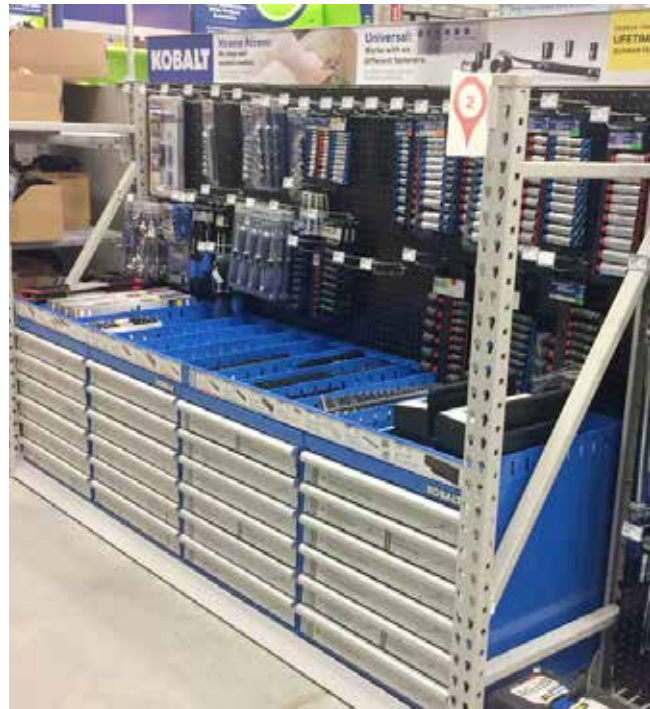
KOBALT - Retail Merchandising