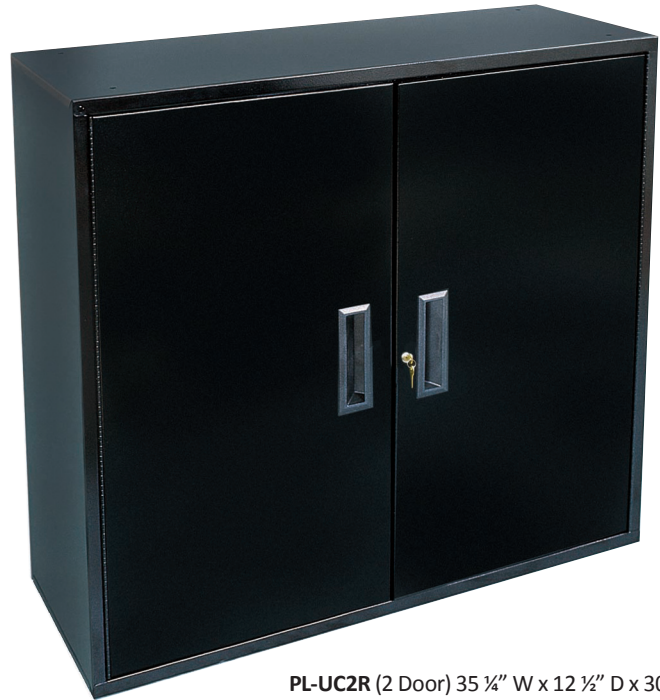
PL-UC2R (2 Door) 35 1/4" W x 12 1/2" D x 30" H

See our complete line of stock and custom products at plattlabonia.com & Craftline.us